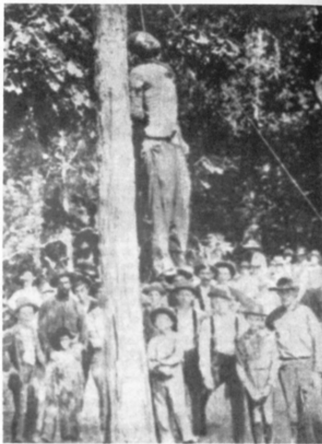
Scene of lynching at Clanton, Alabama, August 1891.